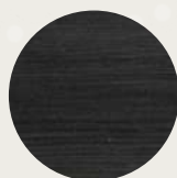
Oak Black Stain