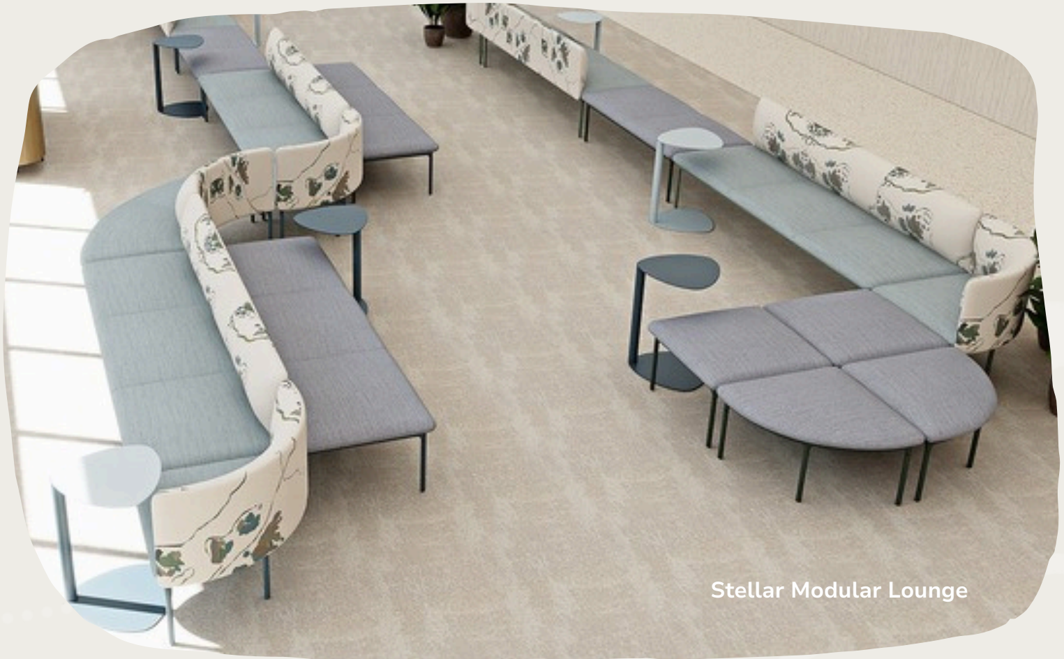
Stellar Modular Lounge

Winya is a multi-award-winning , Indigenous-owned commercial furniture manufacturer delivering high-performance, culturally inclusive, and environmentally responsible solutions across Australia. With a decade of experience delivering projects in the health sector, we are a trusted supplier to hospitals, aged care providers, mental health facilities, and community health organisations nationwide. Our approach blends durable, clinically appropriate design with social and environmental impact — making us a preferred partner for healthcare fit-outs that demand more.