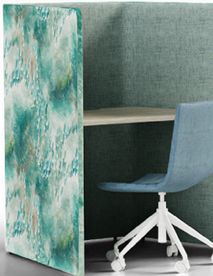
Baluwaa Focus Booth