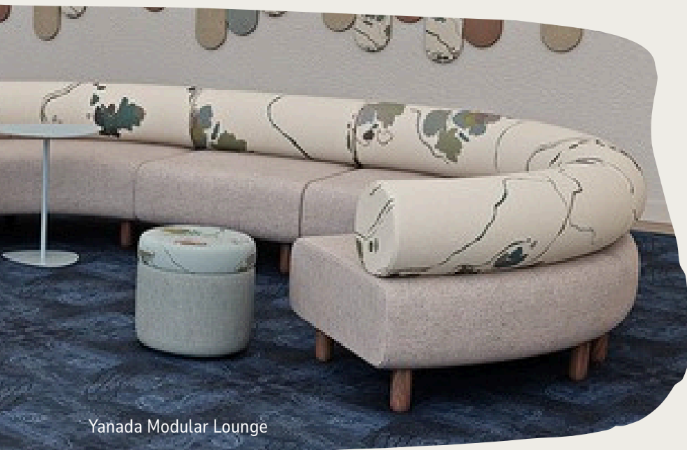
Yanada Modular Lounge