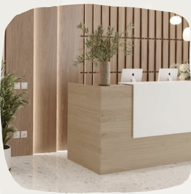
RECEPTION & JOINERY