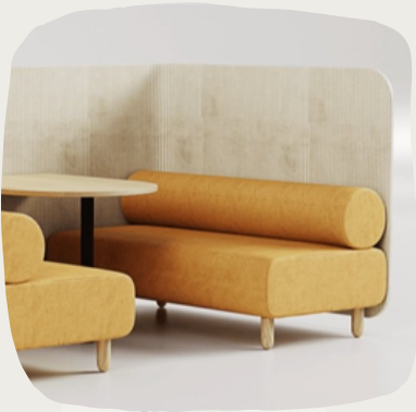
BOOTHS & PODS