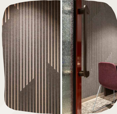
ACOUSTIC & SCREEN SYSTEMS