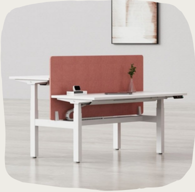
DESKS & WORKSTATIONS